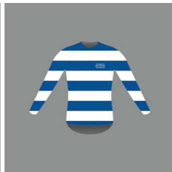
Long-sleeved base layer