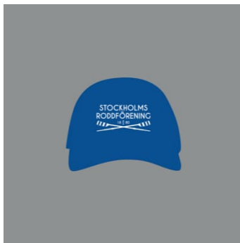
Club baseball cap